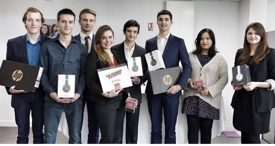
Inter Campus Events: Job battle Caen 2017