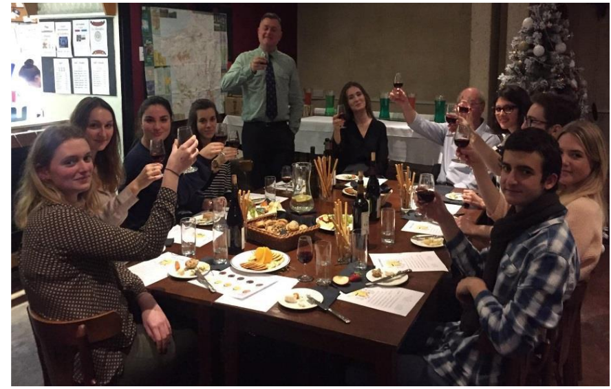
Wine club events