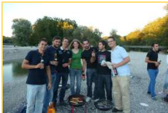
Barbecue, campus Munich, fall 2011