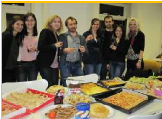
International Dinner, campus Frankfurt, spring 2012

Feel free to contact your German buddy whenever you could need a little help or would like to meet with a local!