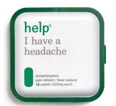
Figure 2. The trend "simplicity" in action

The long medical word "acetaminophen" can be difficult for understanding among people who are far from the medicine. The note "Help. I have a headache" makes it easier for catching on the pill's applicability.